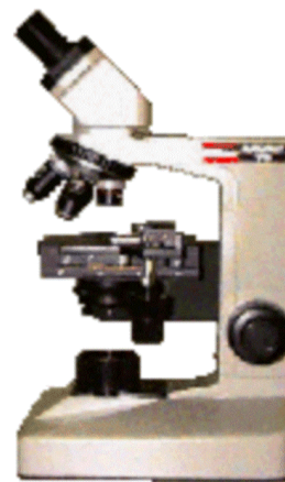
The Compound Microscope